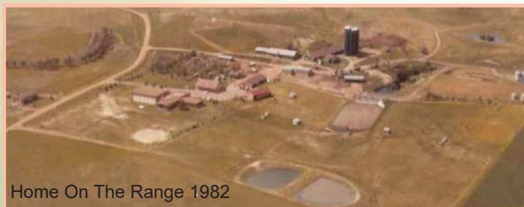
Home On The Range 1982

The first building was built in 1950. This building had a kitchen, dining room, Father’s office and rooms and bathrooms for the boys. As Home On The Range grew over the years, new buildings were needed.