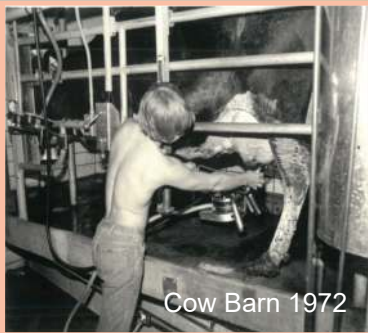
Cow Barn 1972