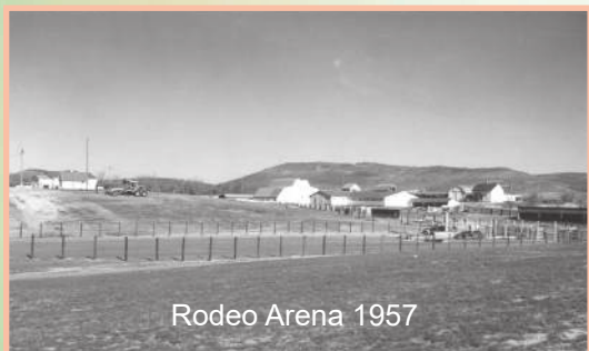
Rodeo Arena 1957

In 1957, the first rodeo arena was created. The arena has been updated a few times. First, in 1991 where bucking chutes were added to the south end of the arena. Later, in 2021, the old arena was torn down and a new one was put in its place. The arena panels and pens were made of iron and sucker rod, new bucking chutes and announcer’s stand were built, and we added new concession stands.