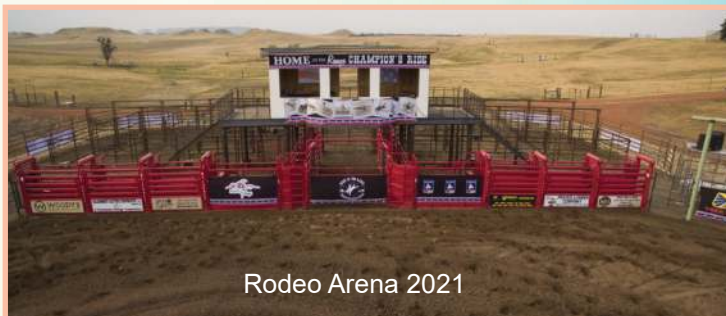
Rodeo Arena 2021

The next big project was Eagle Hall - the boys’ dormitory. Fundraising and construction began in 1960. The building would have two separate wings, a full-size gym, chapel, classroom/library and a recreation room.