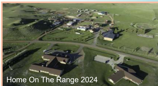
Home On The Range 2024

In 1957, the first rodeo arena was created. The arena has been updated a few times. First, in 1991 where bucking chutes were added to the south end of the arena. Later, in 2021, the old arena was torn down and a new one was put in its place. The arena panels and pens were made of iron and sucker rod, new bucking chutes and announcer’s stand were built, and we added new concession stands.