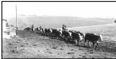
Hereford herd (1950)

Donate online anytime or set up an automatic monthly donation at https://hotrnd.com/