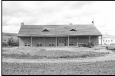
First building (1950)