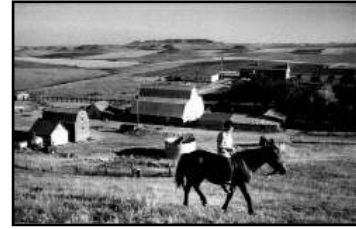
View of ranch