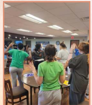
Hip, Hop and Hope