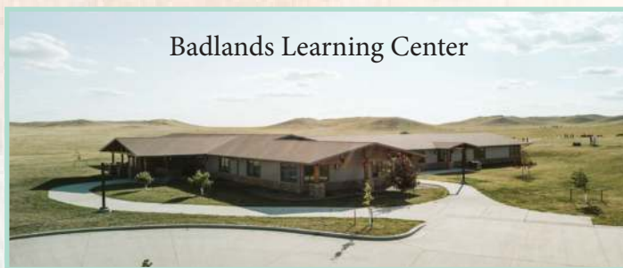
Badlands Learning Center