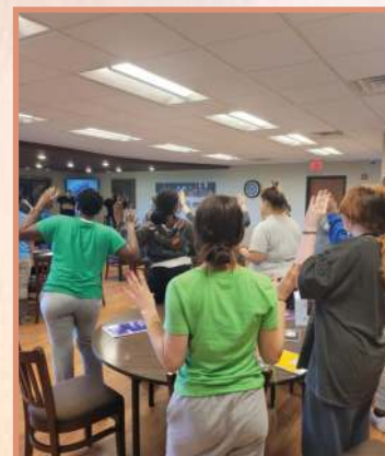
Hip, Hop and Hope