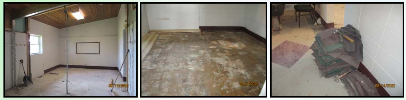
The boys and staff have got a lot of the demo done in Eagle Hall East!