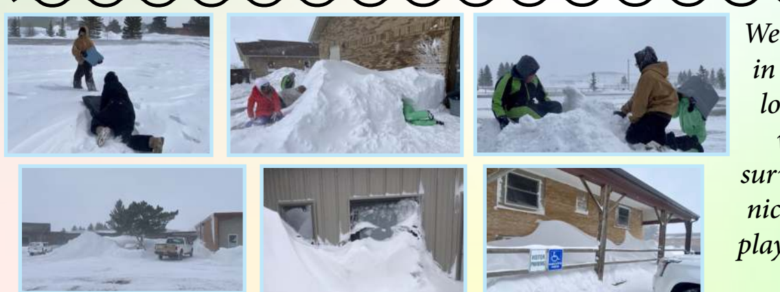
We had 2 blizzards in April, bringing lots of snow and wind! We all survived and it was nice to see the kids playing in the snow!